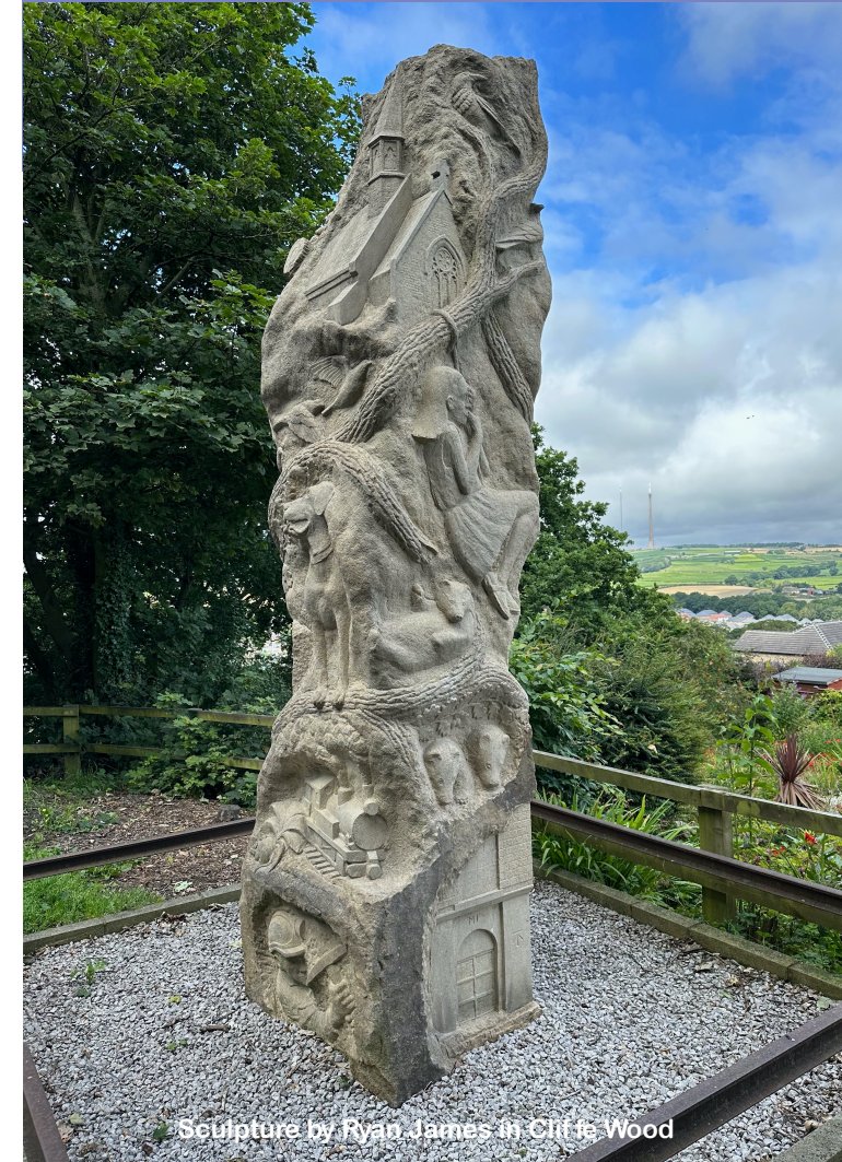
Sculpture by Ryan James in Cliffe Wood

Allow a couple of hours for a leisurely 3 mile stroll around the scenic village of Clayton West. Stout footwear is advisable.