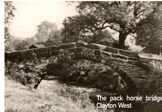
The pack horse bridge, Clayton West