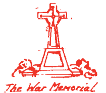
The War Memorial

The "Pie Hall" holds a large collection of Pie memorabilia and two of the pie dishes remain in the village. The 1964 dish serves as a giant planter outside the Pie Hall and the 1988 dish holds an entire butterfly garden in the grounds of the village First School!